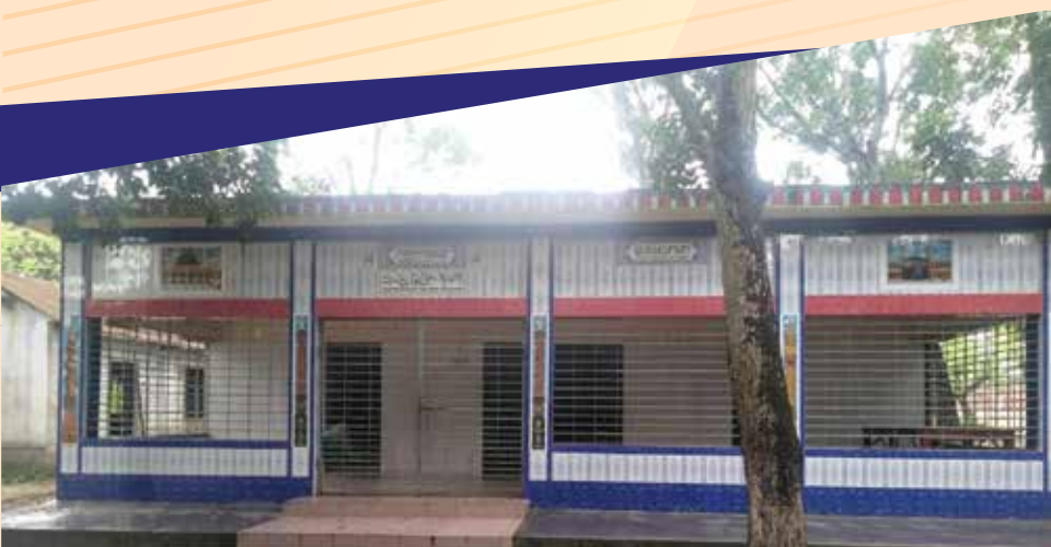
Dattail-Shambhunagar Puraton Masjid