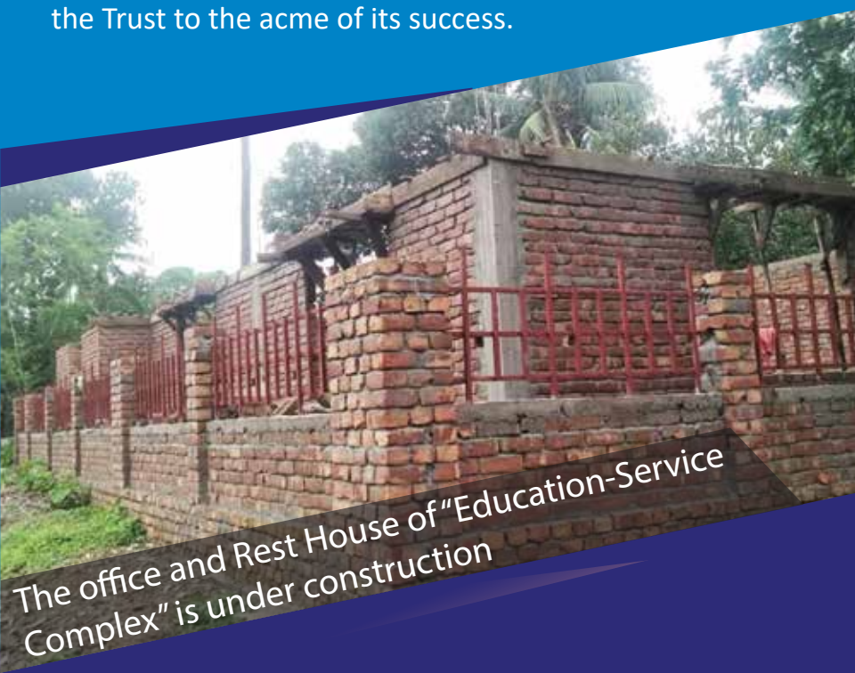
The office and Rest House of "Education-Service Complex" is under construction

■ Academic & Governing Council (AGC): This Council consists of renowned personalities from different universities, local accomplished persons, educationists, and public representatives. As advisor, the work of this Council is to carry out responsibilities related to general-technical-Islamic-education-service and other ancillary activities that lead the Trust to the acme of its success.